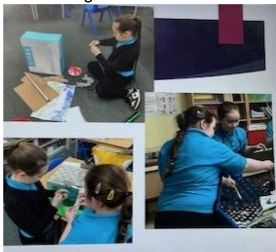
P4 working on their models