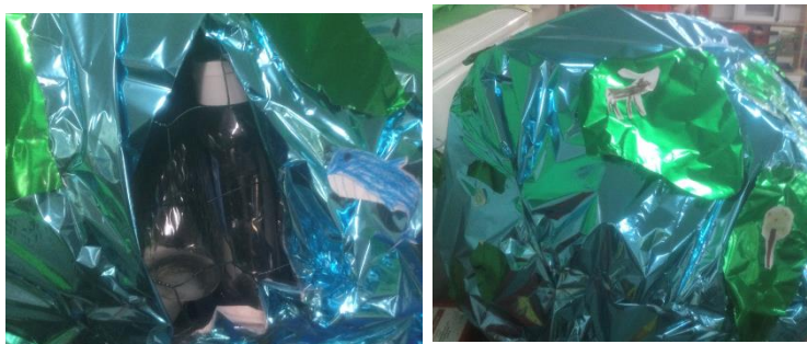
P2 & P3 Planet